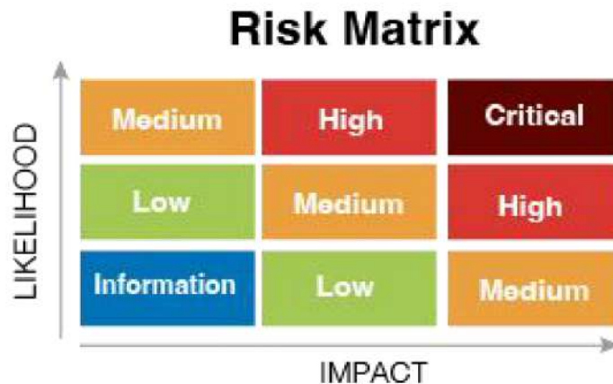
Table 1.1: Overall Risk Severity

To evaluate the risk, we will be going through a list of items, and each would be labelled with a severity category. The audit was performed with a systematic approach guided by a comprehensive assessment list carefully designed to identify known and impactful security issues. If our tool or analysis does not identify any issue, the contract can be considered safe regarding the assessed item. For any discovered issue, we might further deploy contracts on our private test environment and run tests to confirm the findings. If necessary, we would additionally build a PoC to demonstrate the possibility of exploitation. The concrete list of check items is shown in Table 1.2.